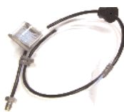
Einlass Tube Standard Bestell Nr. 890-2184