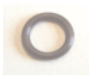
O-Ring Bestell Nr. L456005