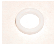
Distanz Ring Bestell Nr. 890-2166