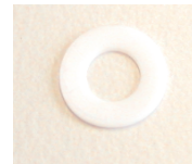
Distanz Ring Bestell Nr. 060-3076