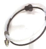
Auslass Tube Standard Bestell Nr. 890-2183