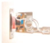
Quecksilber Lampe Bestell Nr. 890-2008